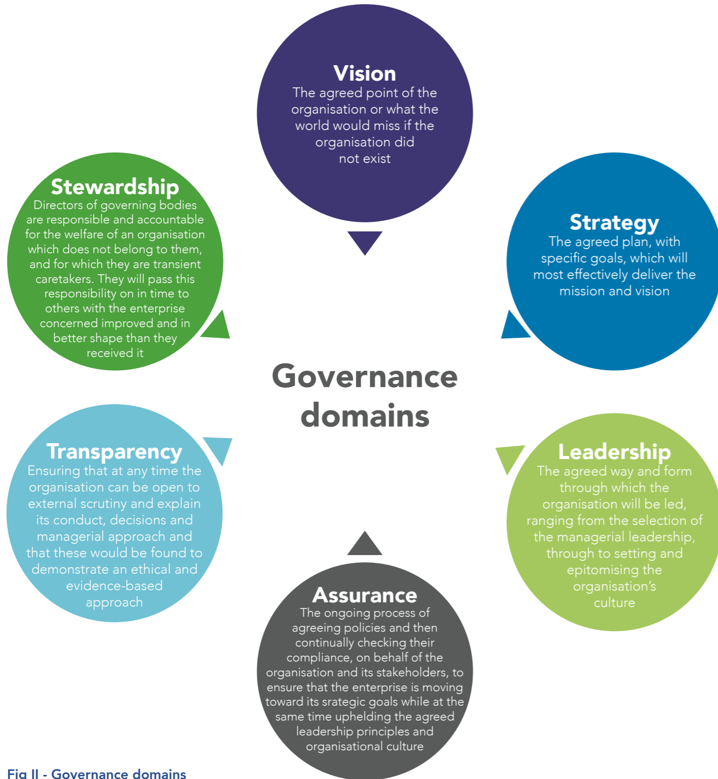
Fig II - Governance domains

How can a board achieve this? Clearly the board must focus on what as the board can uniquely contribute to the organisation. There are six domains that are essential to the progress towards the outcomes described in Fig II below: